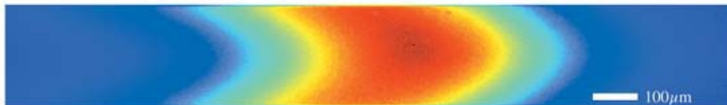
(e) Focusing of bodipy sample in thermal gradient shown in (d) with E = 40 \text{ V/mm} and \lambda = 530 \text{ nm}