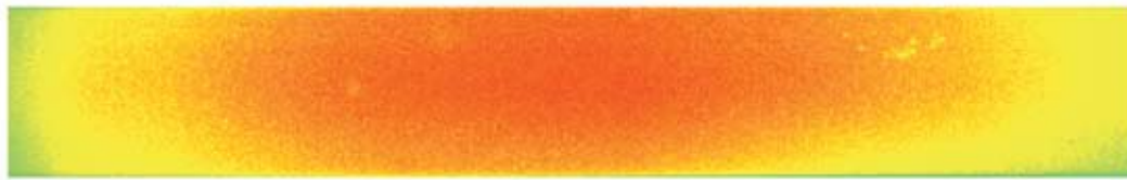
(c) Raw image of temperature-dependent rhodamine B fluorescence intensity at \lambda = 580 \text{ nm}