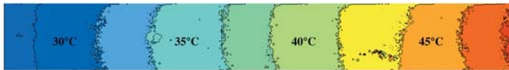
(d) Contour plot of processed temperature field showing 2.5^\circ\text{C} isotherms